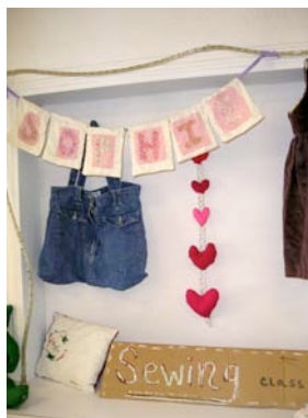
Sewing Class Display

For more information on Block Classes for the fall, see Grass Valley Block Class News on page 5.