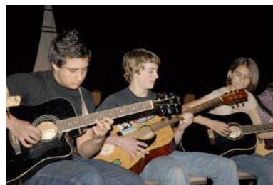
High school Guitar students play a song