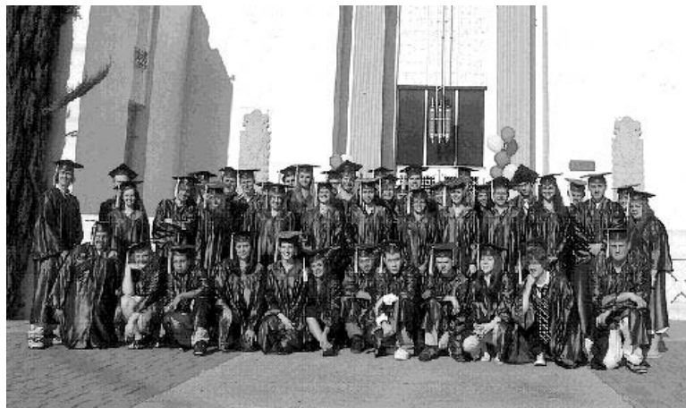
The class of 2006