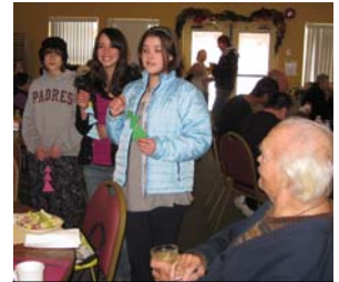
Students at the Senior Center

very cold, Santa was able to join us for the celebration.