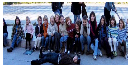
Creekside students at the California Academy of Science