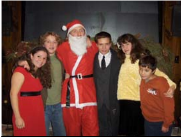
Students with Santa