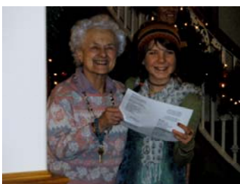
Connecting with the elderly at Quail Ridge

We are still fundraising and would truly appreciate you saving your recyclable items for us and bringing them by our class. We will host another pizza night in March, and we will also have a huge dinner/dance event in early May where the students will teach the community to dance!