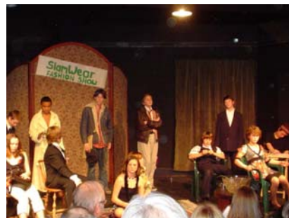
8 th Grade Co-Op Improvisational Play