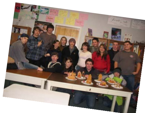
11 th and 12 th Grade IDEA Academy with holiday graham cracker houses