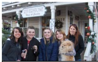
Students at the tree decorating

Lastly, in order to preserve our student budgets for the upcoming Spring Semester, we will have 2 Independent Study weeks. One week will be January 19-22 , and the other week will be March 15-19 . During these weeks, students will receive assignments from block class teachers, and we will be offering field trips to the different age groups. We will keep you posted on these upcoming opportunities.