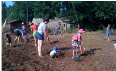
PACE Families Preparing the Co-op Garden

P.A.C.E, the new K-5 co-op at Forest Charter in Nevada City, is off to an exciting start with two dynamic teachers and a group of wonderful K-5 students. P.A.C.E. will be holding classes at Bluebird Farm on Cement Hill Monday, Tuesday, and Thursday from 9-1. We are looking forward to a great year!