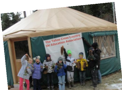
Tree Top Sugarpine