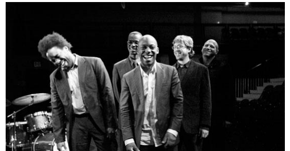
Jazz Reach Band Musical Field trip