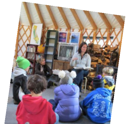
Interactive Learning for the Gold Rush