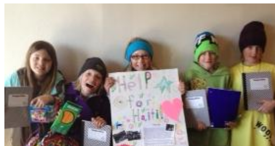
Tree Top "Help for Haiti" Fundraiser